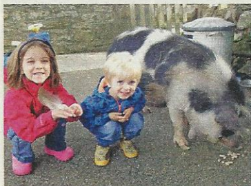
Fluffy the pig is the star attraction

few miles from Bodmin town, star attractions here are Bert and Ernie the goats, Billy the miniature horse and Fluffy the pig. Over in the pets' paddock, youngsters can join in the morning routine of feeding the hens, collecting eggs and tending to the ducks and geese while Mum and Dad relax over the papers in one of the comfortable self-catering cottages.