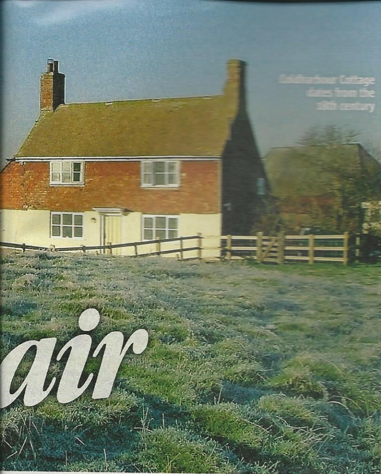
Gullingham Cottage dates from the 18th century