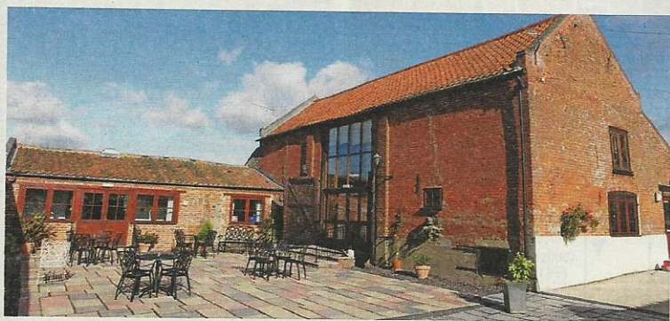
Hearty farmhouse breakfasts are served on the terrace