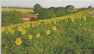
Soak up the beautiful surroundings