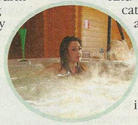
Unwind in a hot tub

And no trip to this part of North Wales would be complete without a visit to the wonderful Italianate fantasy village of Portmeirion.