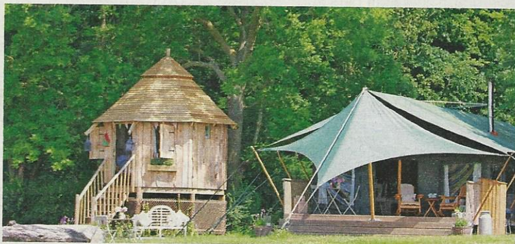
The Dandelion Hideaway's cottages are located close to the woodland