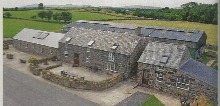
The 200-acre Llwyndyrus Farm is as relaxing and luxurious as it gets