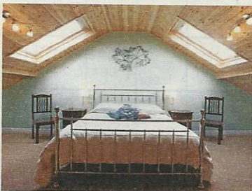
Dairy Barns is stylish and friendly

What's more, Dairy Barns makes a wonderful base from which to explore the area. With water, water everywhere, you can go seal spotting at Blakeney Point, take the kids crabbing on Cromer Pier and enjoy boat rides through the richly scenic Broads.