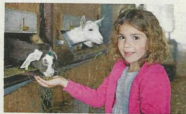
Children can help feed the goats