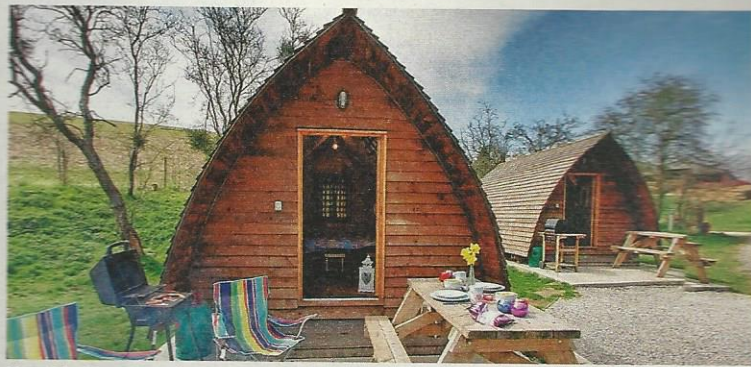
Humble Bee Farm has a wonderful collection of wooden wigwams