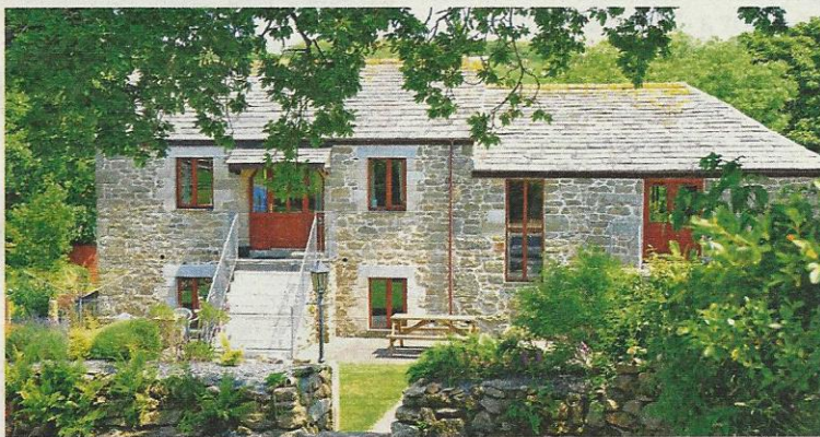
You can stay in one of Chark Farm's comfortable self-catering cottages